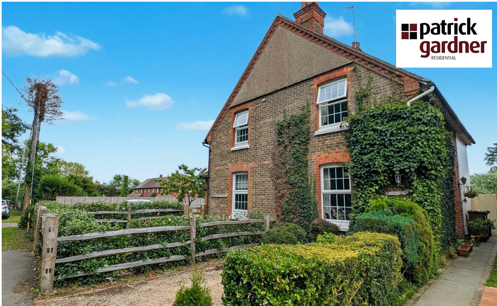
3 Bagley Cottages Ironsbottom, Sidlow, Reigate, Surrey, RH2 8PT